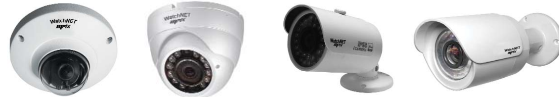
PoE IP Cameras

WatchNET Products are subject to continuous changes and improvements, information on this document is subjected to change without prior notice. 2013 WatchNET Inc. © All Rights Reserved * Not included/sold separately.